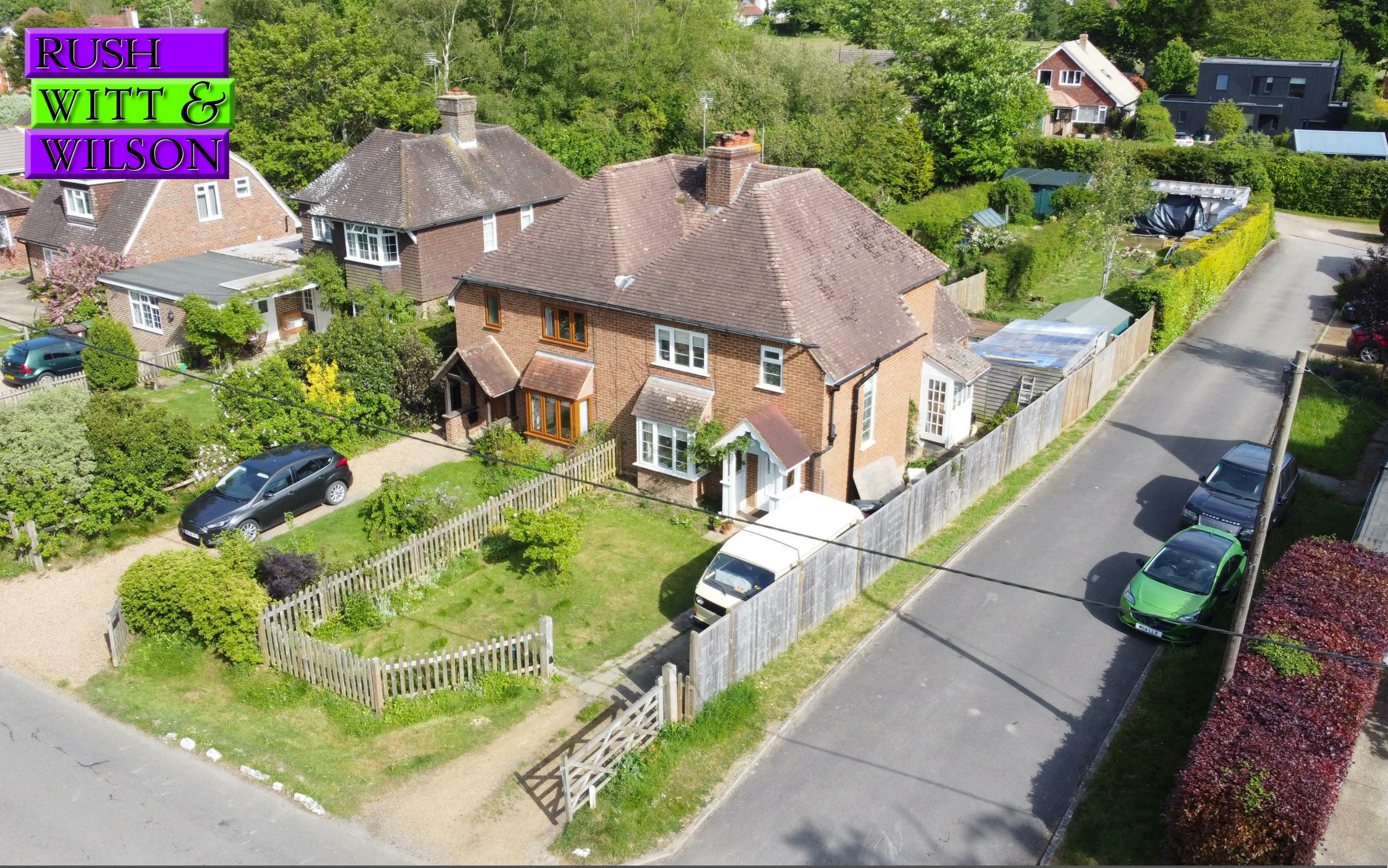
Floreda, Ewhurst Lane, Northiam, East Sussex, TN31 6PA. £465,000 Guide Price.